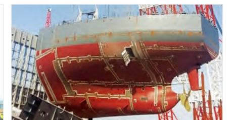
주소 | 경상남도 거제시 사등면 성포로 303 Tel. +82 55. 680. 5600 Fax. +82 55. 680. 5780