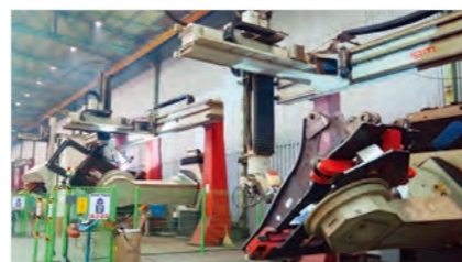
주소 | 경상남도 창원시 마산합포구 진북면 산단1길 129 Tel. +82 55. 264. 2080 Fax. +82 55. 240. 9299